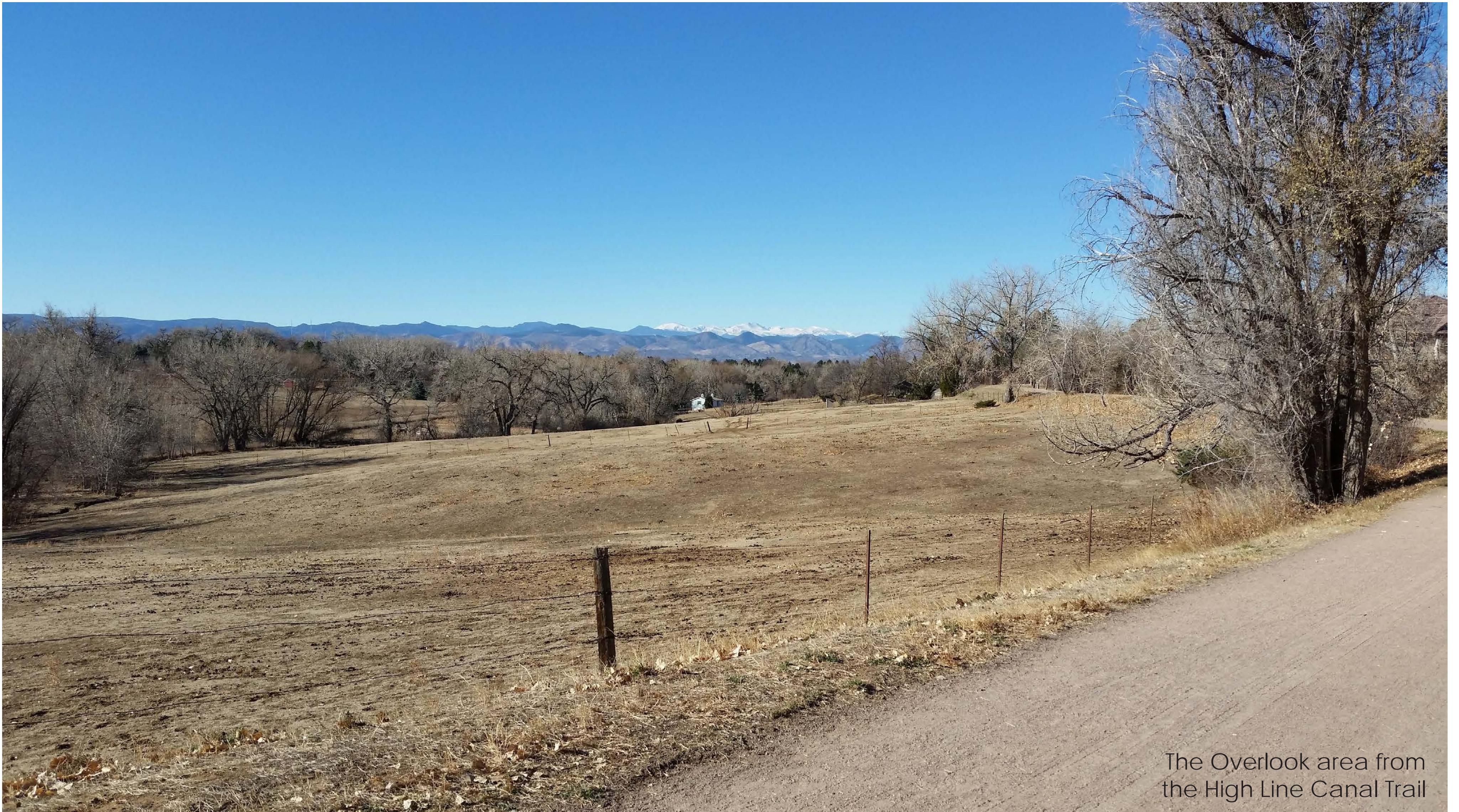
The Overlook area from the High Line Canal Trail